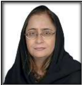
Dr. Azra Fazal Pechuho Minister Health

With faith, discipline and selfless devotion to duty, there is nothing worthwhile that you cannot ACHIEVE.